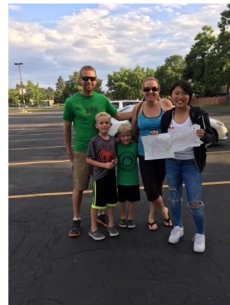
Meeting my home stay family