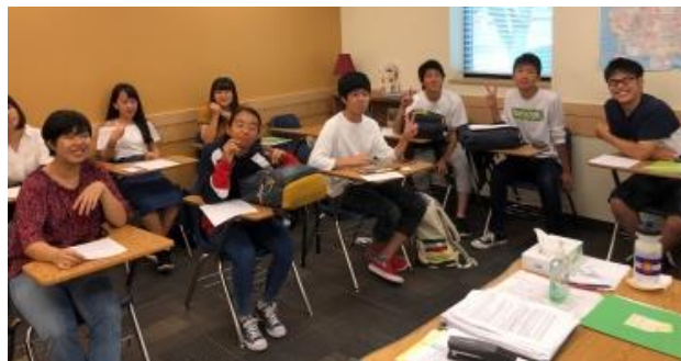
Good morning, teacher! We're studying English in America!