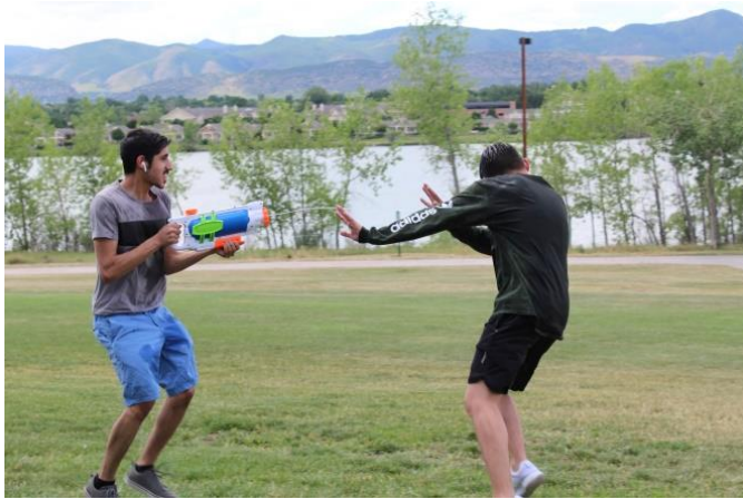
Study abroad can also get you wet in a water gun fight. Students have fun at the summer picnic in Clement Park.