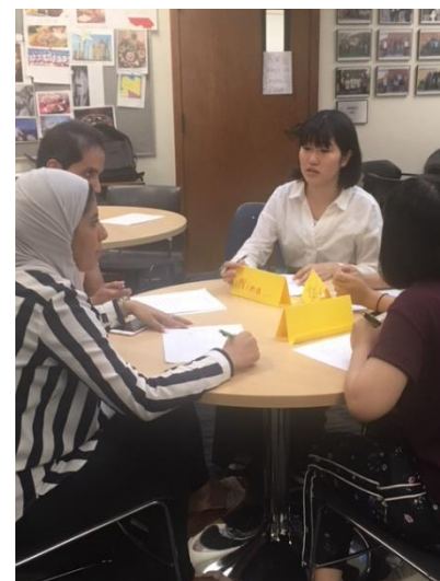
Practicing our conversation with Spring International intensive program students