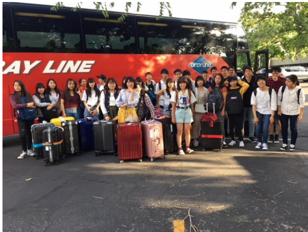
We're finally here! Arrival by bus at Spring International in Littleton